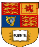
Imperial College London